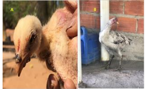
Figure 6 – Subsistence poultry breeding around a poultry matrix farm in Balsas County, MA.

In total, 92.5% (n=37) of the interviewed breeders have stated that the birds were sick. They used antibiotics to treat the birds, which were followed by other products such as vaccines and deworming, as well as by homemade medications. Based on folk knowledge, 92,5% (n=37) of farmers have reported to use alternative or prevention treatments in their birds, among them one finds bark from native trees ( sucupira , pau amarelo ou “ amarelão ”, angico , fava d’anta , aroeira , catinga de porco , pau d’arco ) and other homemade medications such as pepper, lemon, mango leaf. Barbosa et al. (2008) recommend using water melon seeds, papaya, melon and banana tree tillers for deworming.