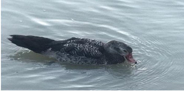
Figure 3 - Duck bred (wild x domestic) in a visited poultry farm around the poultry matrix farm in Balsas County - MA.

In addition, interviewees in 90% of the farms said to breed many species along with the broilers, for instance, dogs (92.5%), swine (27.5%), bovines (20%), goats or sheep (15%), among others, such as cats and horses (15%). Because virus samples isolated from birds can infect other animal species, there is the need of taking this possibility into account when one assesses some sanitation aspects of places where different animal species are simultaneously bred. Therefore, these aspects were taken into consideration in the present study.