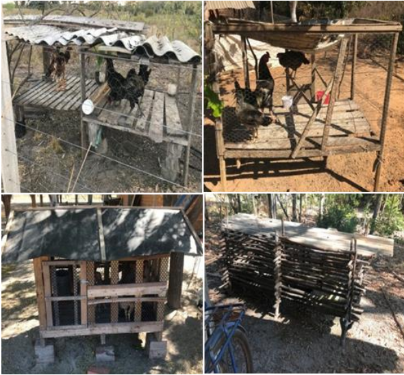
Figure 4 – Rustic structure (grajau or cevas) used in poultry breeding around a poultry matrix farm in Balsas County – MA.

It was possible observing the moment when the birds were slaughtered for trading during one of the interviews. The slaughtering procedure was carried out in an improvised way and lacked hygienic-sanitation care (Figure 5). It is important calling the attention to the fact that ingesting contaminated food can cause many diseases, which have direct impact on the public health system and indirect impact on labor capacity. Accordingly, much effort has been made to elaborate rules and policies aimed at inhibiting and on eventually extinguishing illegal food manufacturing. Despite all this effort, these practices remain and make this business competitive.