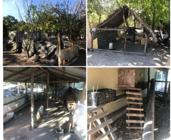
Figure 2 - Rustic hen houses of subsistence poultry farms around a poultry matrix farm in Balsas County - MA.

Based on results of the direct observations, 72.5% (n=29) of subsistence poultry breeders presented rustic hen houses manufactured with materials found in the property itself, such as wood, straw and canvas. The structure respected the natural habits of the birds such as scratching the ground, running and having easy access to water and food (Figure 2).