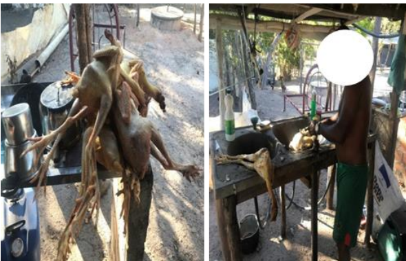
Figure 5 – Poultry slaughtered in a subsistence poultry farm around the poultry matrix farm in Balsas County – MA.

When it comes to sanitation aspects, farmers were asked if they had evaluated the seek birds in the last two months and 65% (n=25) said no. When they were asked about what poultry diseases they knew, 72.5% of them have reported to know “gogo” and 27.5% (n=11) did not know any disease.